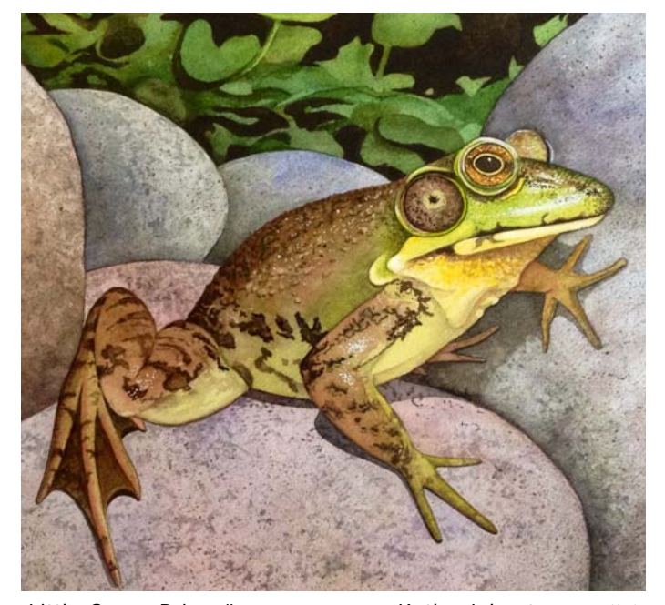
"Little Green Prince"

11:00 AM ~ 4:00 PM Stockton's Kramer Hall 30 Front Street ~ Hammonton, NJ